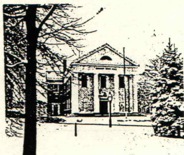
Sudbury Town Hall New Home of Sudbury Historical Society