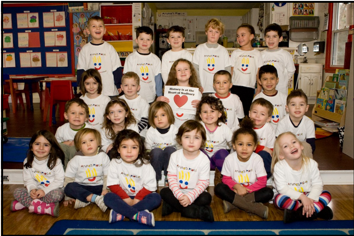
The children at Aruna's Place showing how they "heart" Sudbury.

Imagine what these little ones will know about Sudbury in the future!