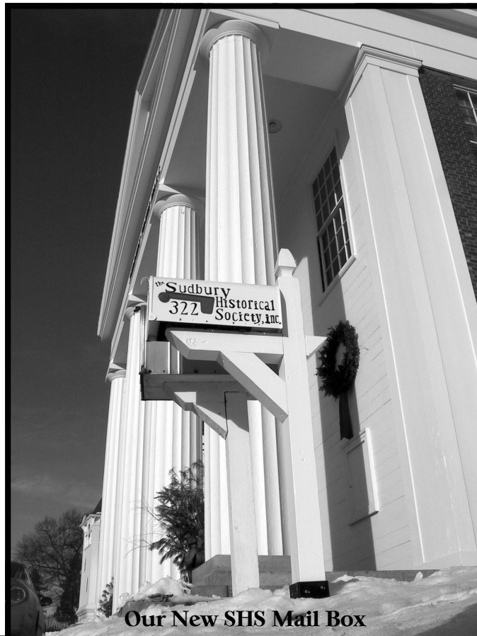
Our New SHS Mail Box

The Officers, Trustees and Curator of the Sudbury Historical Society, Inc. wish you all a Happy and Healthy New Year filled with many blessings.