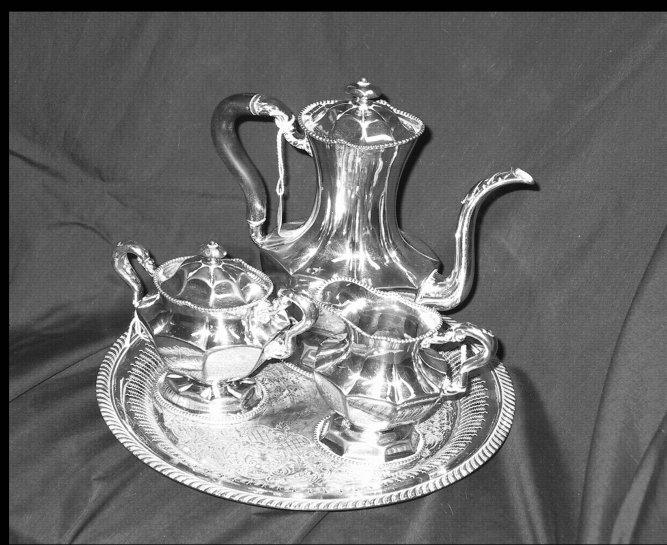
This lovely silver plate tête-à-tête coffee service (1910) (pictured above) and an additional tea service were donated by the Raymond Family (Raymond's Dept. Store) of Raymond Road, Sudbury

SUDBURY IS RICH IN HISTORY, WE ONLY NEED TO LOOK WITHIN FOR OUR PROGRAMS, WE ARE SO FORTUNATE!